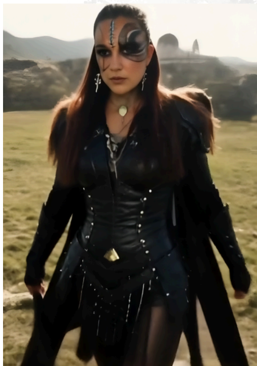
✍️ Morhwen - Cortesía